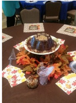
(See what I mean...?)